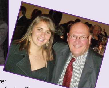
Clockwise from center above: